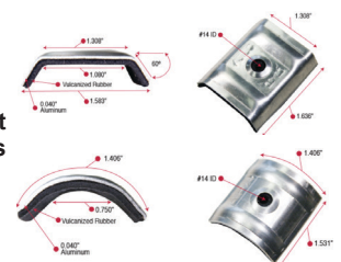
Styles for flat and curved ribs

All information is non-binding and without guarantee. Before using the products, all specifications and calculations must be checked by a suitably qualified person and local regulations must be observed. This document is subject to revision. We reserve the right to make technical changes. (0321-1)