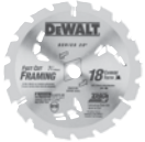
Combination Framing DW3171, DW3178, DW3176, DW3182, DW3184

For all-purpose cuts in natural wood, plywood and wood composites.