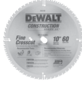
Fine Crosscuts DW3126, DW3128

For all-purpose cutting in natural wood, plywood and wood composites.