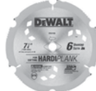
HardiPlank® Fiber Cement DW3193

Anti-stick coating reduces buildup on the blade when cutting pressure treated or wet lumber..