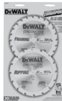
Combo (DW9155, DW9154) DW9158