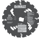
Pressure Treated / Wet Lumber DW3104

For fine crosscuts in natural wood, plywood and wood composites.