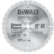
General Purpose DW3103, DW3114

For all-purpose cutting in natural wood, plywood and wood composites.