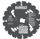
Pressure Treated / Wet Lumber DW3174

For all-purpose cuts in natural wood, plywood and wood composites.