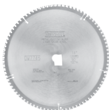
Thin Gauge Metal DW7745