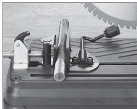
Cut forward of the blade center line and never cut bundles