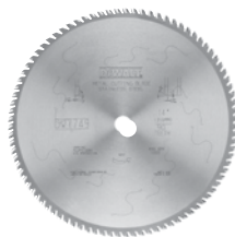
Stainless Steel DW7749