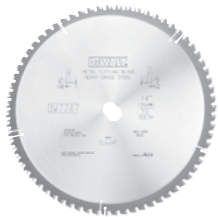
Heavy Gauge Metal DW7747