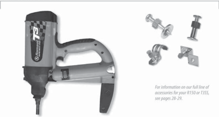
For information on our full line of accessories for your T150 or T3SS, see pages 28-29.