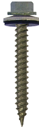
PANEL-TITE® SS Stainless Steel